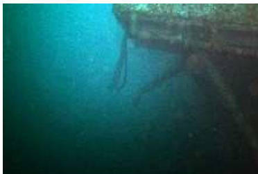
On the tower