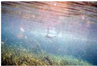
Comerant on surface