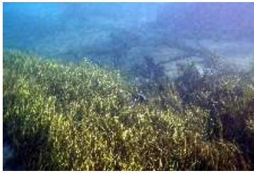
Comerant in Gras