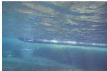
The boat from below