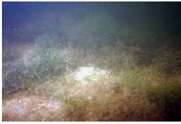
Top of mound