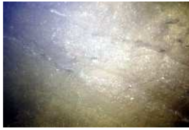
Side of cutout