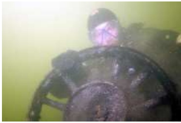
Model A Wheel