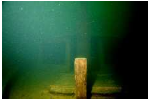
Bow of Junk