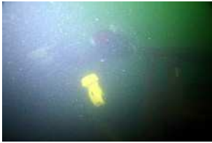
Diver with DPV