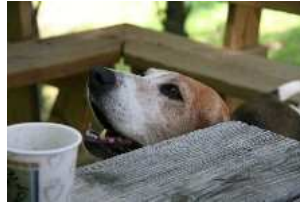
Cassie, Bill's dog