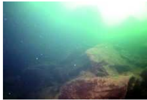
Looking up the wall