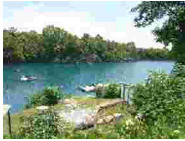
View of Blue Water Q