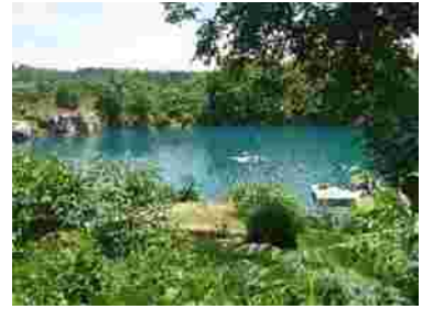
View of Blue Water Q