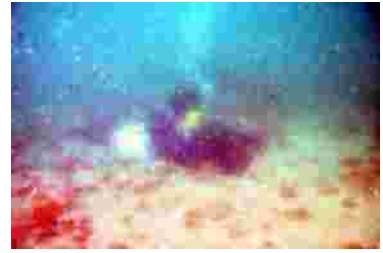
Diver exiting APC