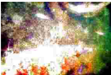
Side of Barge