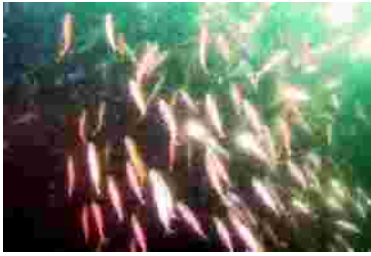
Bait fish school