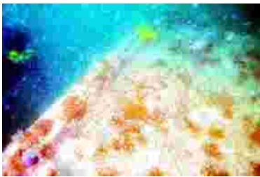
Diver looking at APC