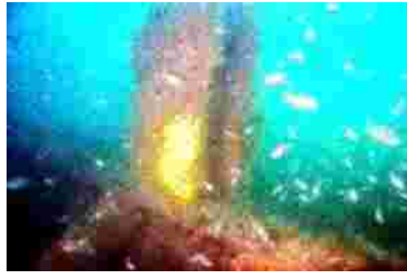
Top of Barger