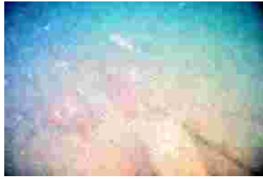
Top of barge