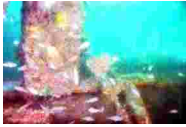
Top of garge