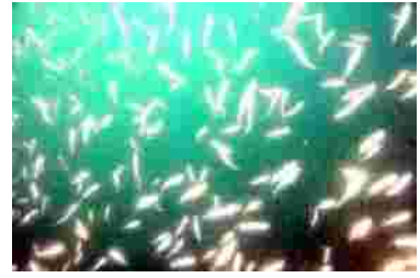
Edge of bait school