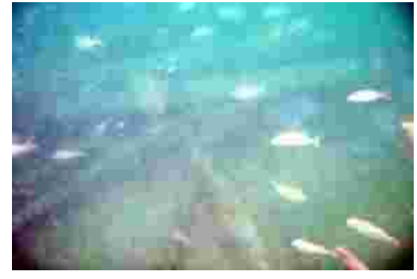
Top of barge