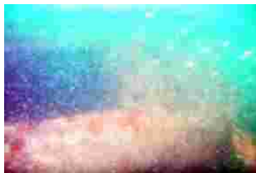
Side of barge