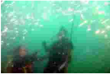
Susan looking at sch