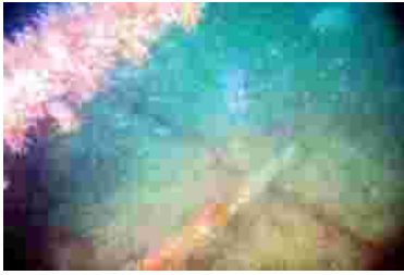
Top of Barge