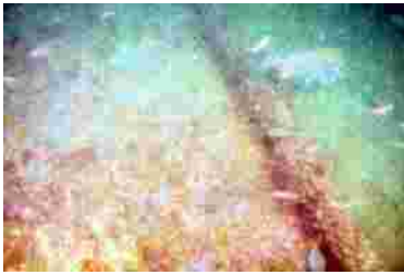
On the barge