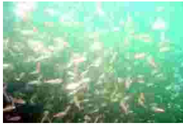
The bait school