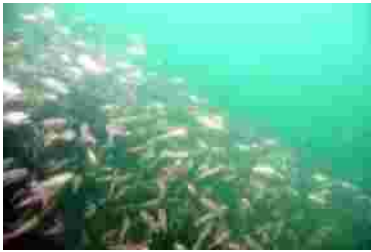
The invisible wall